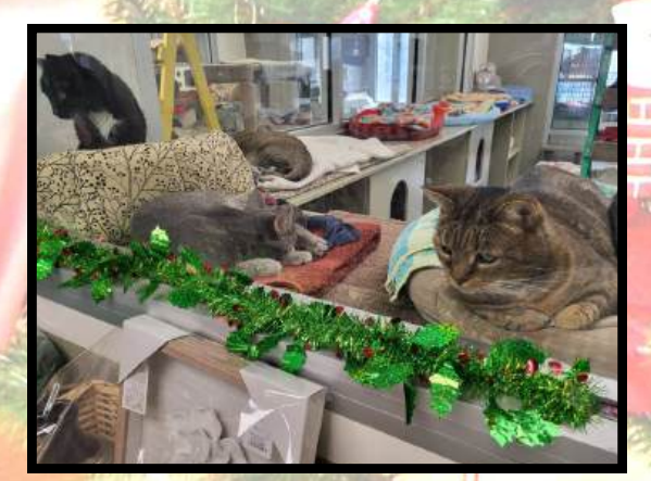
We had so many baskets that the social spilled over into the cat kennel. As you can see, the cats didn't mind the extra activity in their home