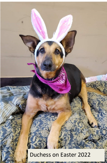
Duchess on Easter 2022

It's a reality of animal rescue that some animals may be in the shelter for a long time if they don't get adopted. We never adopt out animals unless the right match is possible, for the welfare of both the animal and the adopting family. Some animals will end their years as our residents. While we would love to see all our rescues in loving forever homes, we know that some animals will live out their days with us.